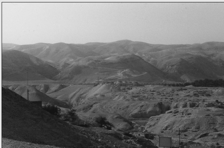
John the Baptist grew up in the wilderness of Judea. The wilderness of Judea is not a place of thick underbrush, as one might imagine, but barren hills with little vegetation.

The early life of John is hidden in obscurity. This only is revealed about it, "And the child grew, and waxed strong in spirit, and was in